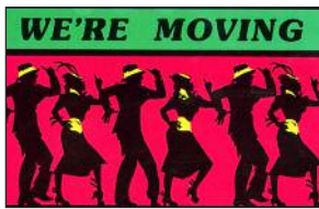
We're Moving Dancers DMO