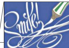
Toothpaste Smile FRE-806