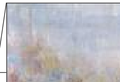
Pastel Landscape FRE-805