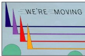
Moving Van DMO-981