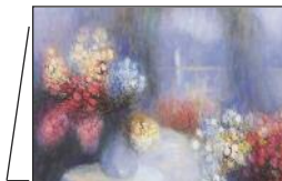
The Garden FRE-800

With Blank Envelope - Return Address Imprint Available (see pricing on insert sheet)