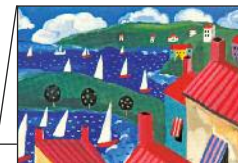
Rooftops - Artist T. White FRE-812